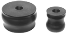
Crown Molding Dies Available Now!