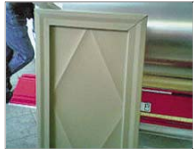
Custom Shutter Example Using Brick Mold Dies