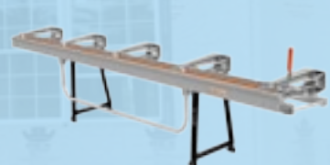
Trim-A-Brake™ II T1050