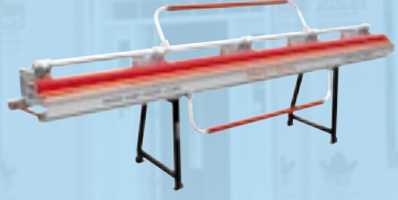
Mark I Series™ M10